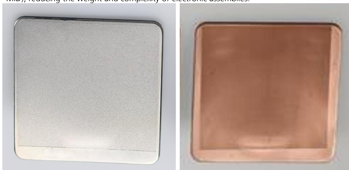
Image: Left - Laser-structured ABS substrates, seeded with Palladium (Pd) nanoparticles and Nickel-plated, Right - Laser-structured ABS substrates, seeded with Silver (Ag) nanoparticles and Copper-plated.

While India has a very mature ecosystem for Laser and Plasma technologies as separate industries, the specific hybrid integration, using lasers for micro-structuring followed by atmospheric pressure plasma for chemical-free nanoparticle seeding, remains a specialized competency of Fraunhofer IFAM. Indian industries are highly proficient in the individual components of the LaStrADA process, but they typically apply them for different purposes.